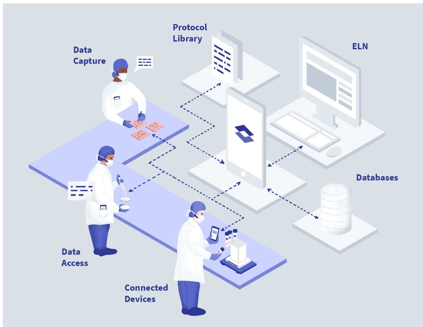
Fig.3: Digital lab assistants as a hub between scientists at the bench and lab informatics.