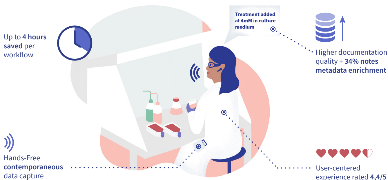
Fig.2: Digital lab assistants as a lab companion.

As a practical assistant for all types of lab work, LabTwin includes smart tools such as voice-activated timers, calculations, and error-preventing systems, which can be seamlessly incorporated within the workflow. With hands-free data capture and access in real time, LabTwin increases efficiency by saving time, reducing errors and ensuring overall data integrity.