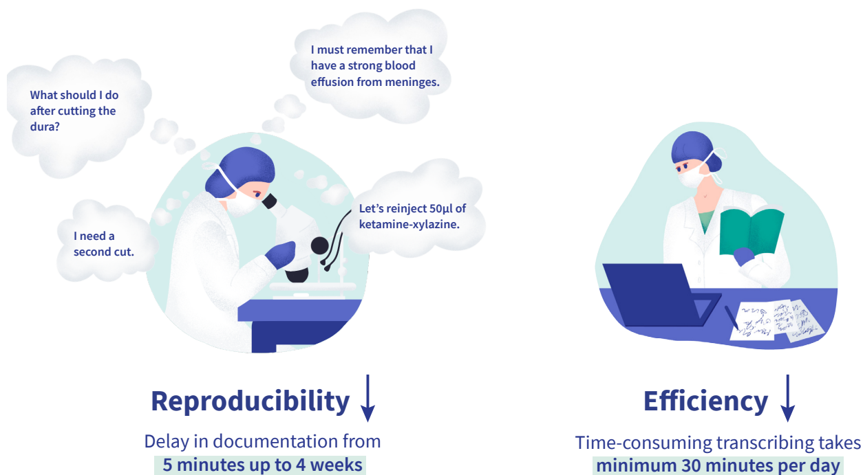
Fig.1: Challenges of documenting with ELN.